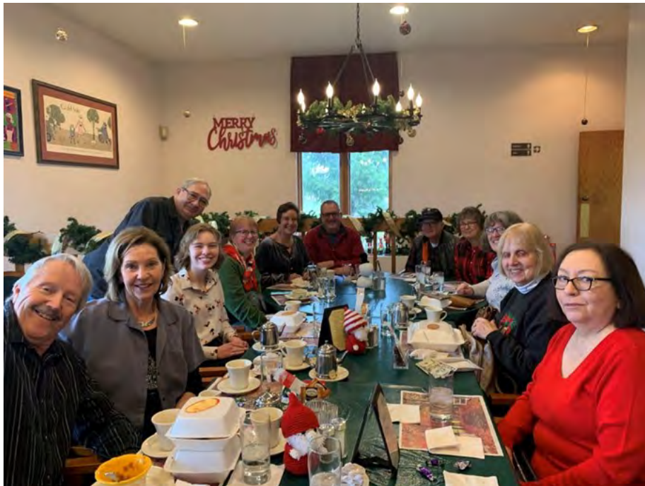
Holiday Gathering in December