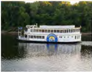
Sunset Dinner Cruises Padelford Riverboats Friday Night