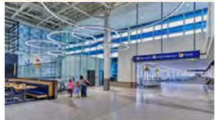
Behind the Scenes Tour Minneapolis (MSP) Airport "Best Airport in North America 2023" by Airports Council International Saturday Afternoon