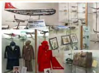
49 ½ Activity Northwest Airline History Center Saturday Morning