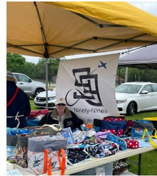
Elkhart Airshow Salute to Veterans

The following weekend consisted of a vendor booth at the airshow in Elkhart. The airshow was a salute to veterans and women in aviation.