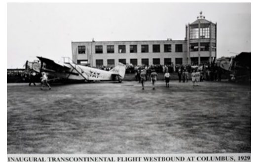
INAUGURAL TRANSCONTINENTAL FLIGHT WESTBOUND AT COLUMBUS, 1929

Port Columbus opened in 1929 and hosted the penultimate stop of the first National Women's Air Derby. But it saw a lot of other action that first year and in the years to follow, including the start and finish of Jerrie Mock's around-the-world solo in her single-engine Cessna. We'll have a chance to tour the old terminal and absorb some of CMH's history, and at the same time expand our knowledge of Ohio's exceptional aviatrixes.